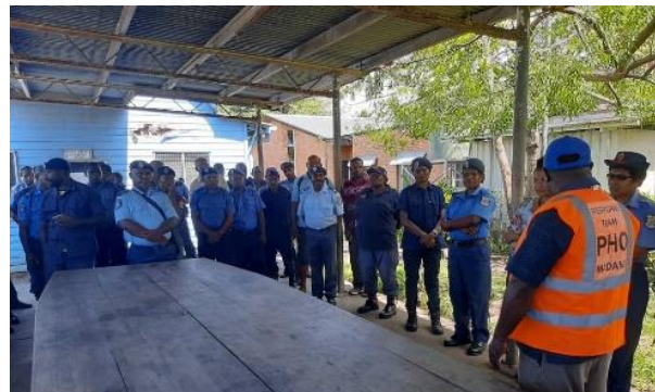
Madang: Awareness on COVID-19 to Police and Madang Technical College