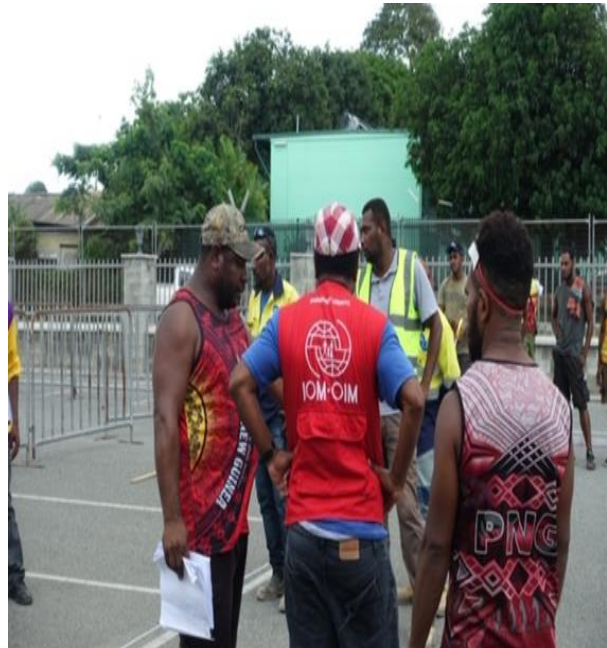
Construction of a multipurpose COVID-19 at Rita Flynn Complex