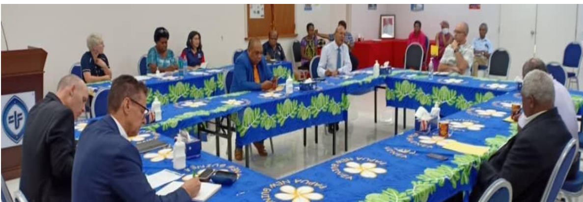
Social mobilization and community engagement for COVID-19: Representatives from the Churches