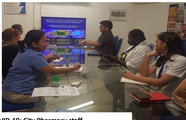
Social mobilization for COVID-19: City Pharmacy staff