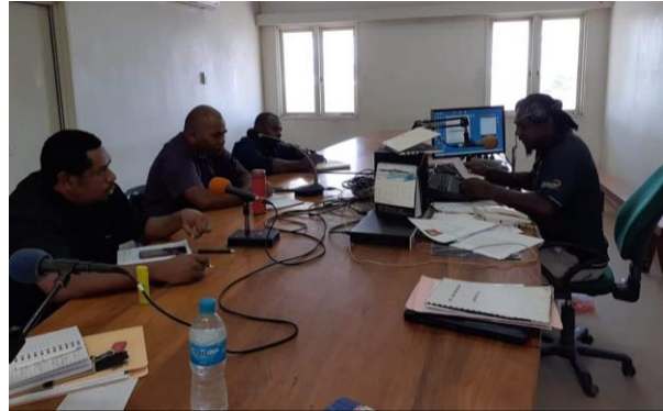
East New Britain: Health workers awareness and radio program on COVID-19