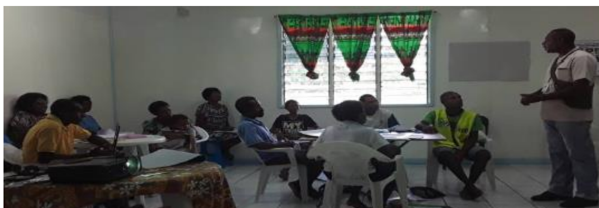
West Sepik: WSPHA volunteers training on COVID-19