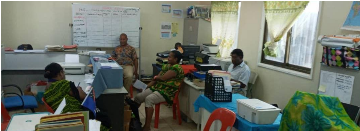
West New Britain: NDoH staff meeting with WNB PHA public health team