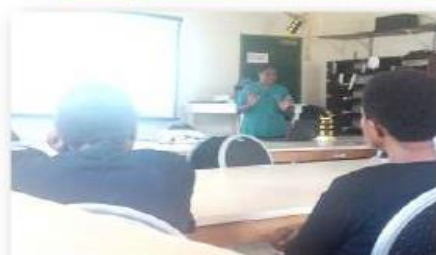
CPHL Team conducting training for the new platform for testing COVID-19 with the GeneXpert machine for the Rapid Response team.