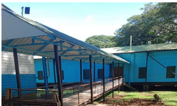
Madang: Isolation ward (newly refurbished)