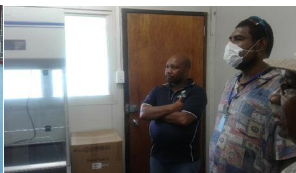
Central: GeneXpert machine at Bereina District Hospital