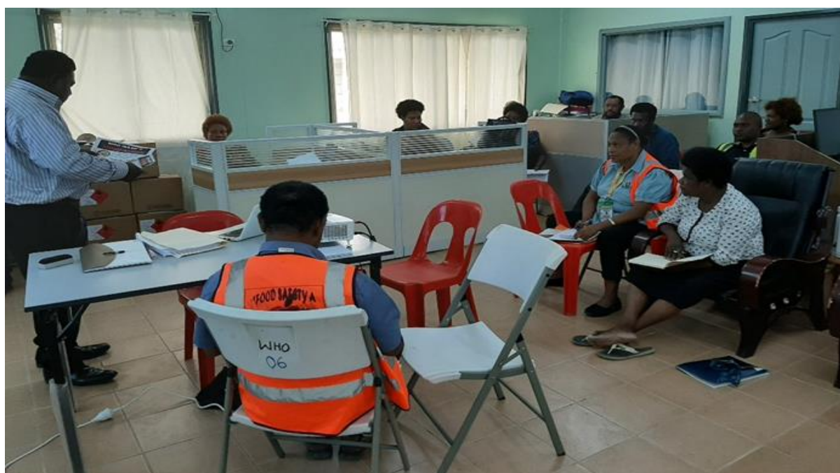
West New Britain: Risk-communication presentation from NDOH during refresher training for PEOC and WNBPHA