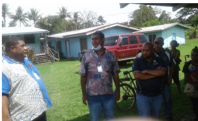
Central: Visit of Hon. Mr Peter Isoaimo at Kairuku/Hiri district