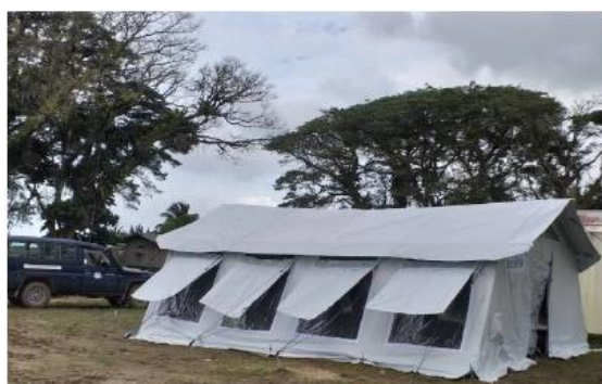
West Sepik: Pre-triage at the quarantine facility