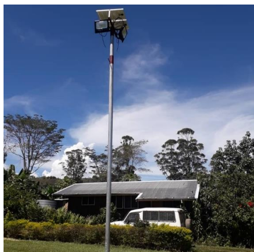
Jiwaka: Isolation facility at Nondgul health centre, North Waghi district