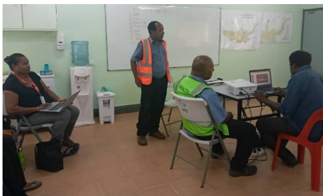
West New Britain: Discussion on sample collection sites