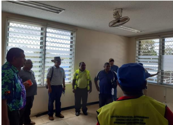
Central: Room Identified for Gene-Expert