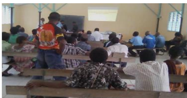
West Sepik: Nuku health staff attending training on COVID-19 and integrated routine immunization