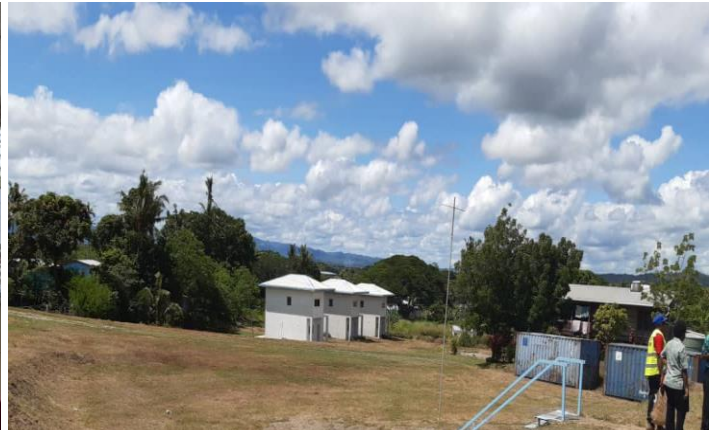
Central: Quarantine facilities for health workers caring for COVID-19 suspect cases and patients