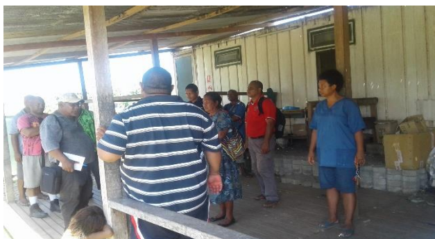
Central: Pre-triage area at Kupiano, Abau District