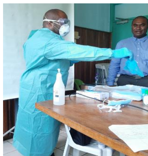
East New Britain: ENB RRT team demonstrating donning and doffing of PPE