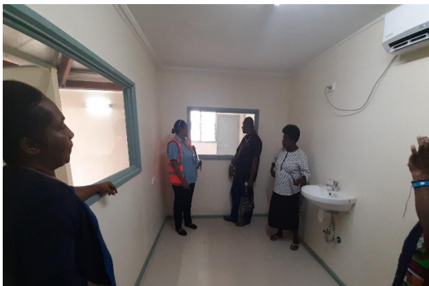
West New Britain: Nurse bay in the new interim isolation and ICU ward, Kimbe Hospital