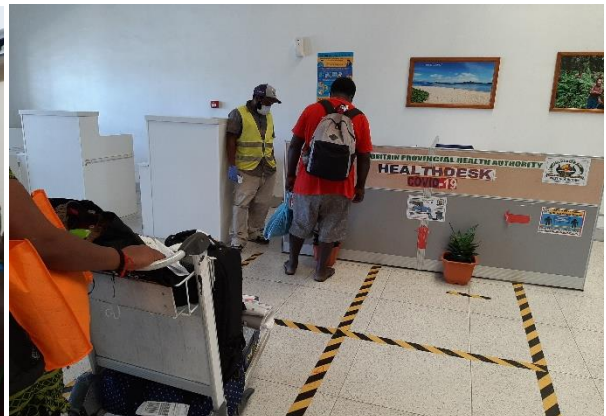
West New Britain: POE set-up at Hoskins airport by Surveillance team