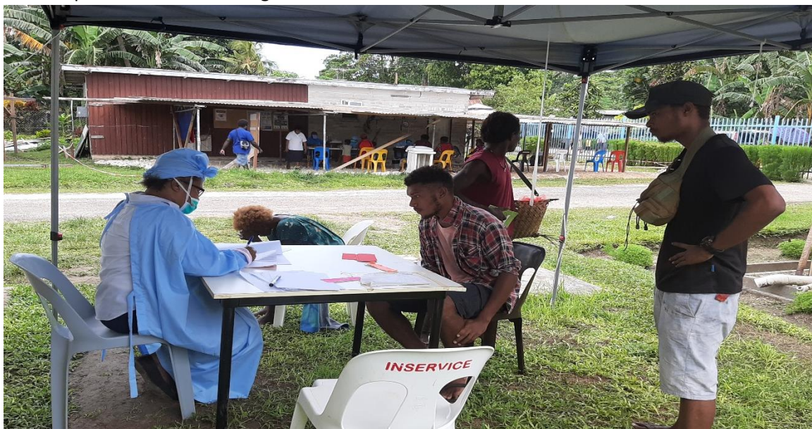
New Ireland: Triage at Kavieng Hospital