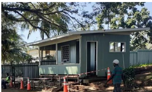
Madang: Pre-triage shed at gate of Modilon hospital