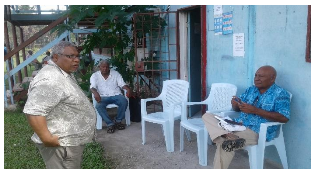
Central: CPHA CEO and Kairuku LLG President at Bereina