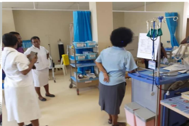
Madang: ICU Ward at Modilon hospital