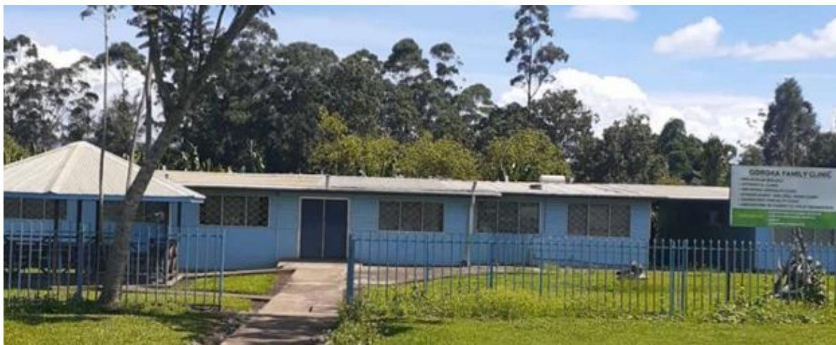
Eastern Highlands: Quarantine facility (6 beds)