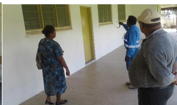
Central: Isolation facilities at Kupiano, Abau District