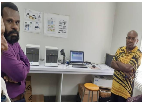
Madang: GeneXpert machine at Modilon hospital