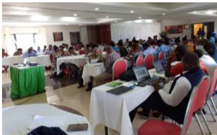
COVID-19 Trainings in the Provinces: Alotau in Milne Bay (upper left photo); Maprik in East Sepik (upper right photo); Wewak in East Sepik (photo on the left)