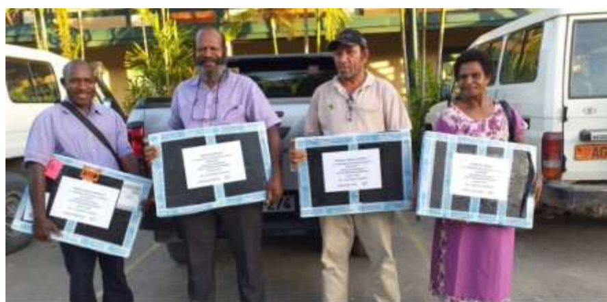
Madang District Health Managers receive their IEC materials for COVID-19 distributed by WHO (L-R: Usino Bundi, Bogia, Middle Ramu and Sumkar)

For more information about this Situation Report, contact: