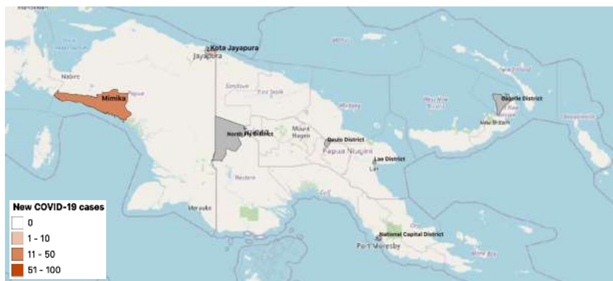
Figure 2. Location of Confirmed COVID-19 Cases in Papua New Guinea by District (as of 20 June) and New Cases Reported in Papua Province of Indonesia (in the past 24 hours)